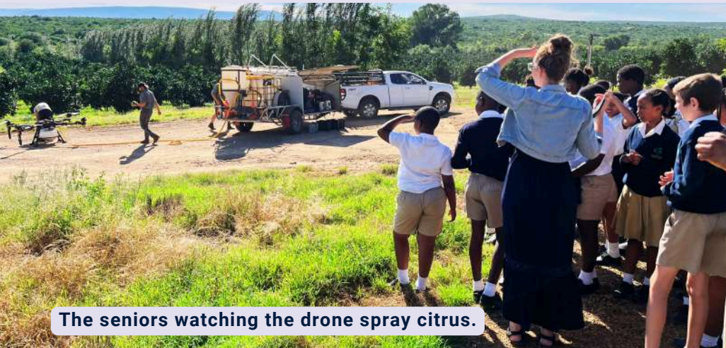
The seniors watching the drone spray citrus.

Term 1 has been full of fun, challenges, and exciting discoveries. We are so proud of our learners' hard work and creativity. We hope you enjoy your holiday, stay safe, and come back ready for more learning and adventure in Term 2!