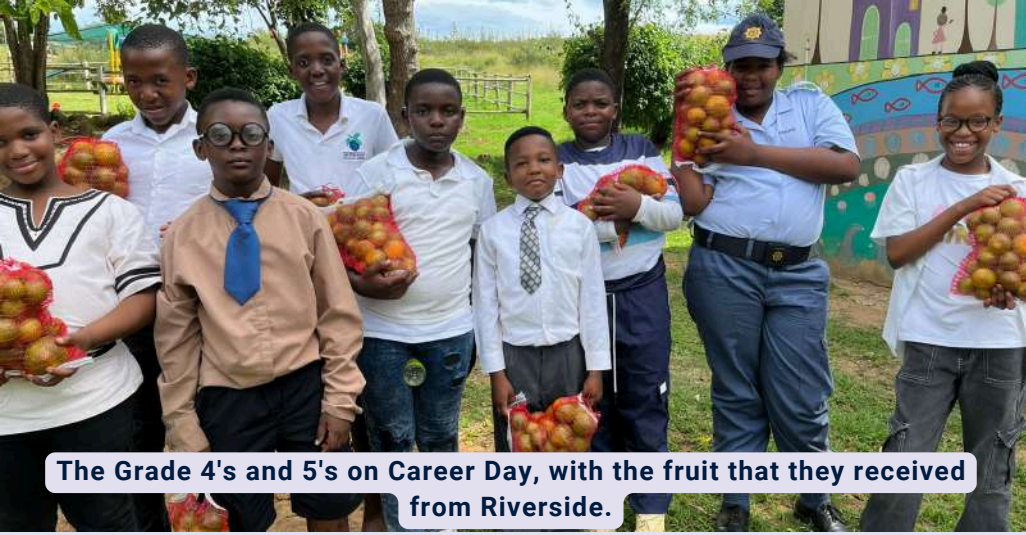
The Grade 4's and 5's on Career Day, with the fruit that they received from Riverside.