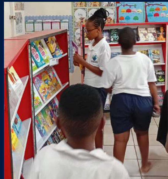
Grade 4's and 5's viewing books at the book fair.