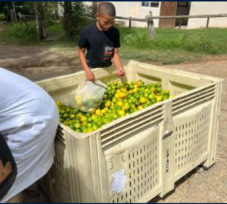
Ayazingca packing naartjies to take home.