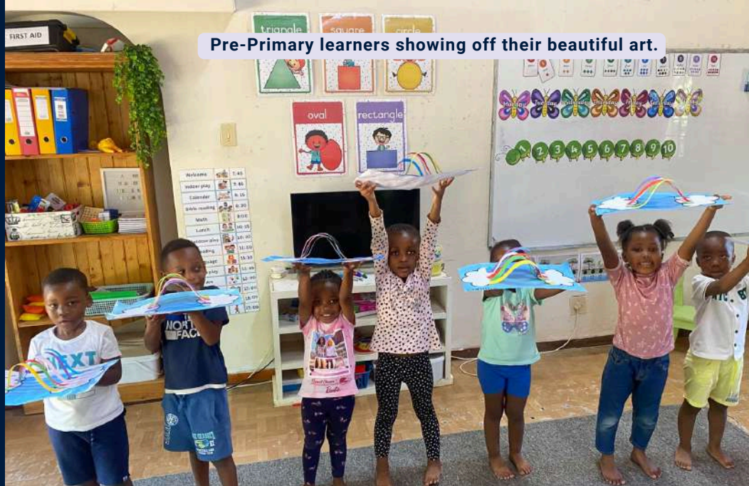
Pre-Primary learners showing off their beautiful art.