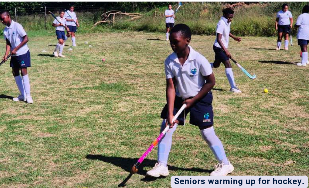
Seniors warming up for hockey.