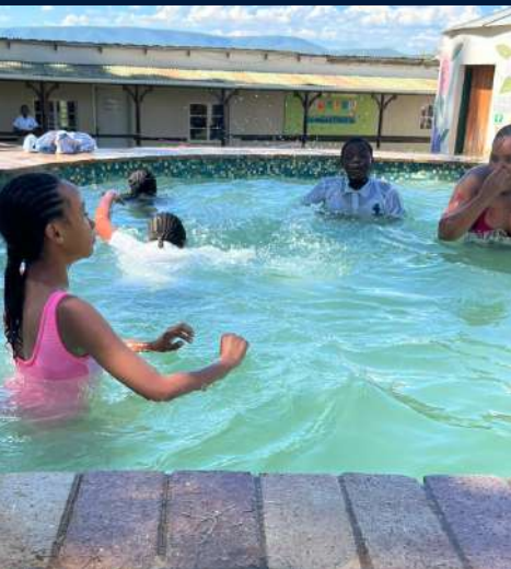
Grade 6's and 7's having a blast in the pool.