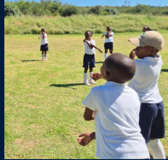
Juniors warming up.

Overall, it has been a rewarding term. All teams have shown growth not only in skill level but also in confidence and character. We look forward to building on this progress in the next term and continuing to develop both the individual players and the teams.