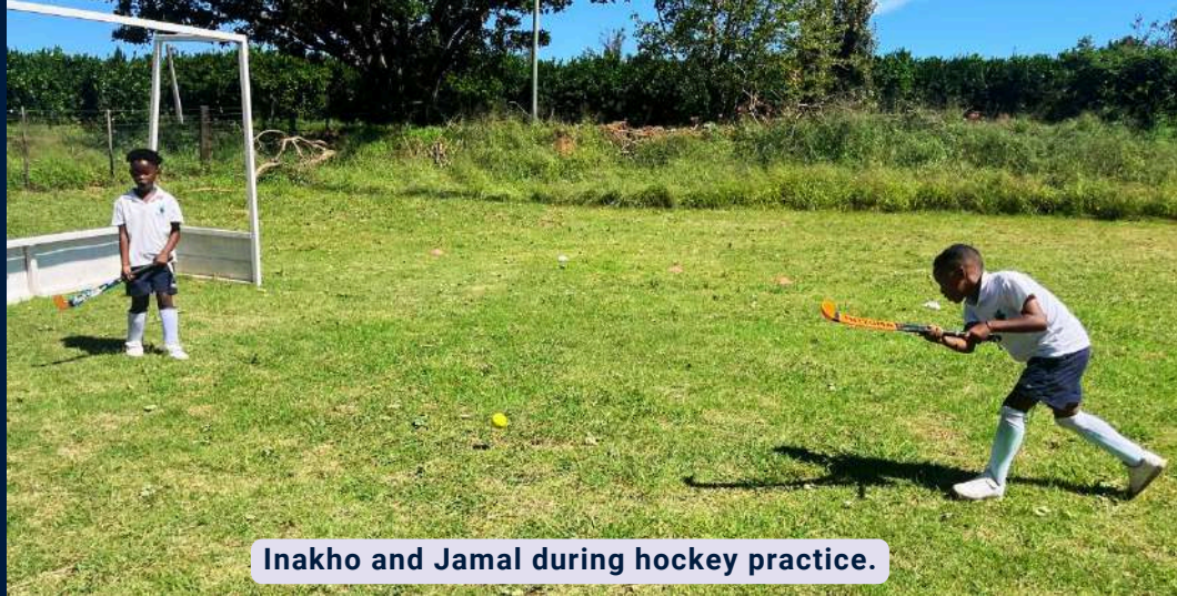
Inakho and Jamal during hockey practice.