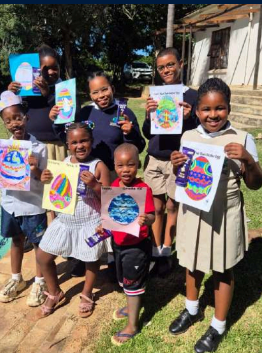
Nizibone with the rest of the Easter Egg prize winners.