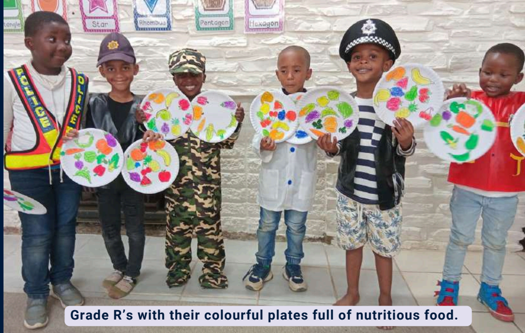
Grade R's with their colourful plates full of nutritious food.