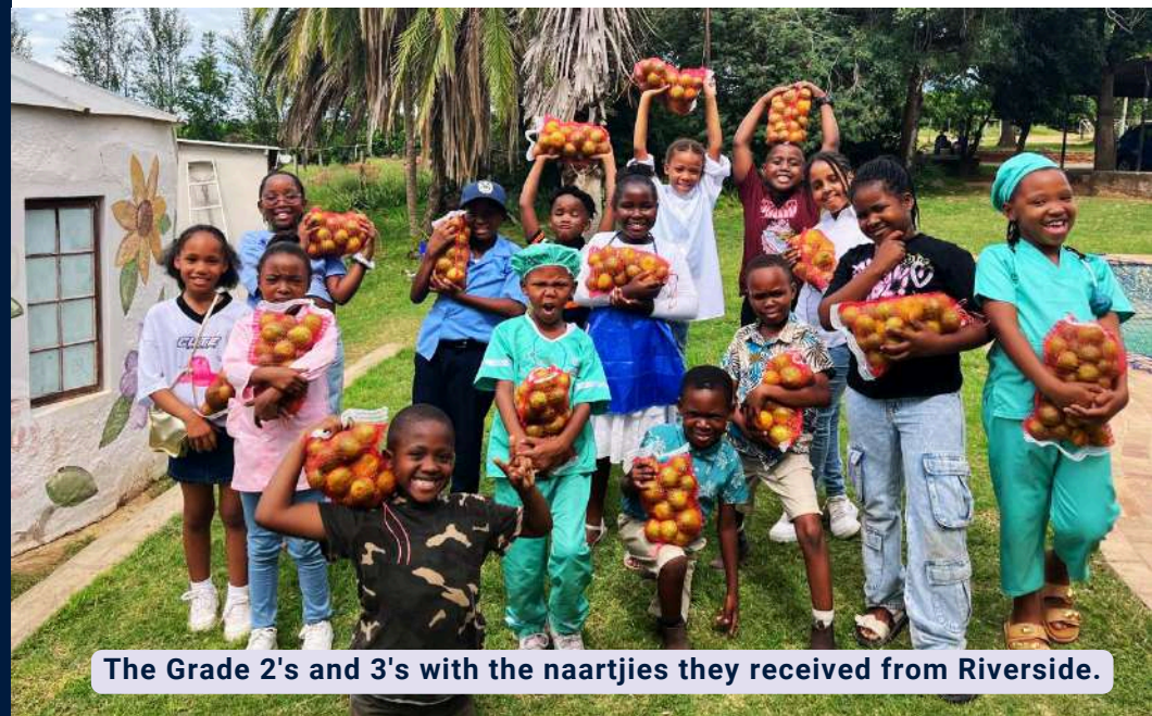
The Grade 2's and 3's with the naartjies they received from Riverside.

We are incredibly proud of the effort, enthusiasm, and positive attitude shown by all our learners this term, and we look forward to even more growth and learning in Term 2.