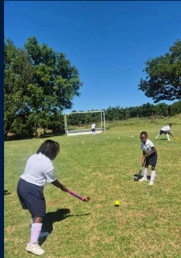
Juniors practicing short passes.