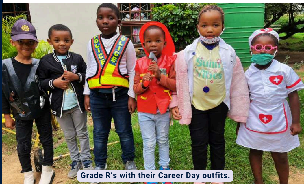
Grade R's with their Career Day outfits.

The book fair was a wonderful experience, and learners confidently selected their own books, showing enthusiasm and a growing love for reading. Career Day was also a highlight of the term, with learners proudly dressing up and sharing their future dreams. Thank you to all the parents for your effort and support in making these experiences so special.