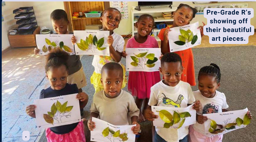
Pre-Grade R's showing off their beautiful art pieces.