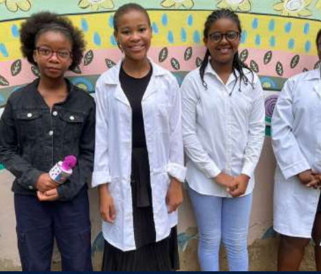
Unabantu, Liminathi and Eldana dressed up for Career Day.

Wishing you all a joyful and peaceful Easter.