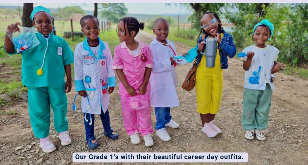
Our Grade 1's with their beautiful career day outfits.