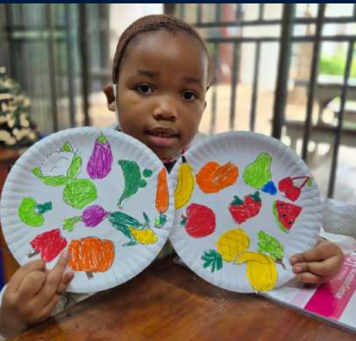
Indiphile with her healthy food plates