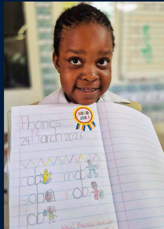
Beloved showing off her neat work!