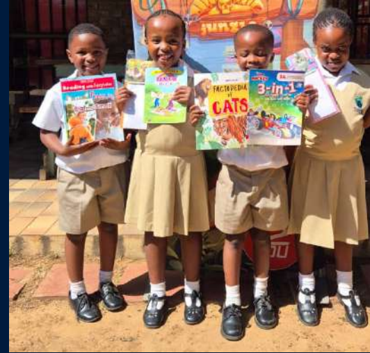
Grade 1's with their new books at the book fair.

Well done to each learner for a wonderful Term 1 filled with growth and happy memories. May you enjoy a restful and well-deserved holiday, and we look forward to welcoming you back for another exciting term ahead!