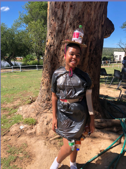
Pictured Left: Grade 7s partaking in the Recycling Fashion Show