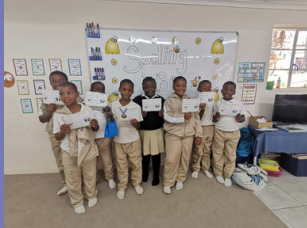
Pictured Above: Grade 2s showing their certificates received for their Spelling Bee competition.