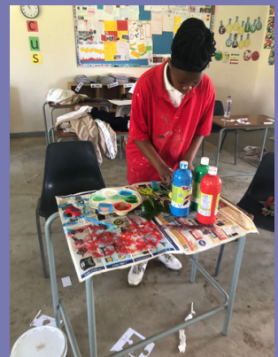
Pictured Above: Kungawo participating in the Big Art Draw.