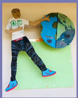
Pictured Above: Grade 6s Big Draw art competition