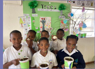
Pictured Above: Grade 1s showing off their bean plants they grew themselves